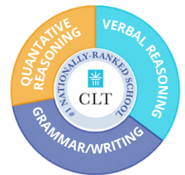
MHA AVERAGE SCORE BY SUBJECT